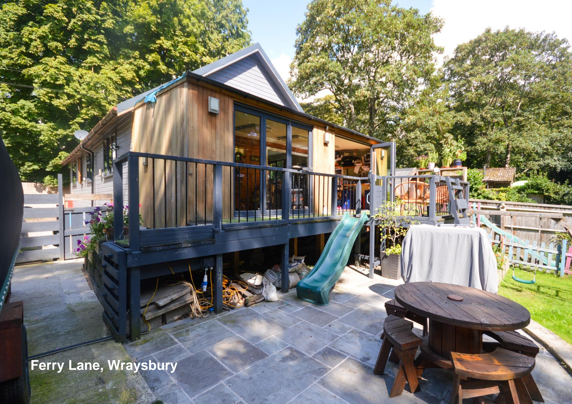
Ferry Lane, Wraysbury