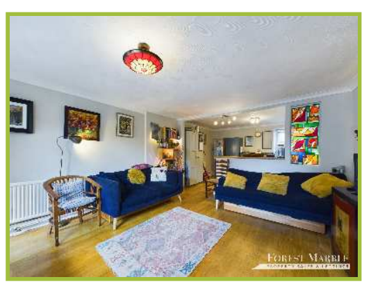
The Retreat, Frome