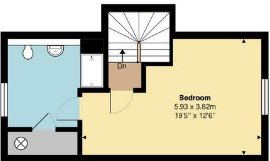
Second Floor Approx 363 sq ft (33.7 sq m)