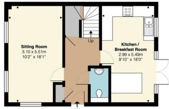
Ground Floor Approx 497 sq ft (46.2 sq m)