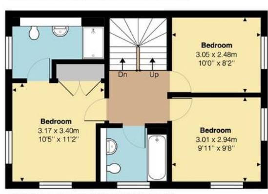
First Floor Approx 497 sq ft (46.2 sq m)