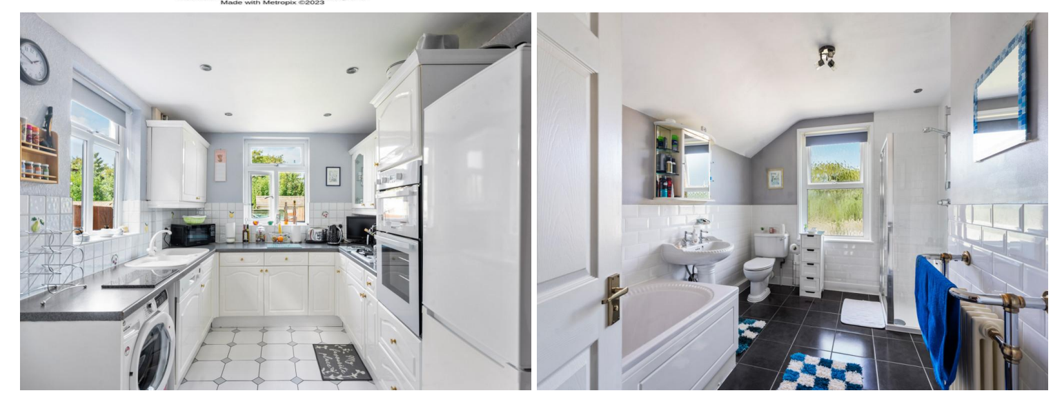
IMP ORTANT NOTE: Paul Graham have not tested any services, heating system, appliances, fixtures or fittings. References to the tenure of a property are based on information supplied by the seller as Paul Graham have not had sight of the title documents. Neither has Paul Graham checked any existing or necessary planning consents, building regulations or rights of way. Prospective purchasers are advised to obtain verification from their solicitor or surveyor. PLEASE NOTE: All measurements are approximate and represent the maximum dimensions of any room (into bays and alcoves) and a margin of error should be allowed.