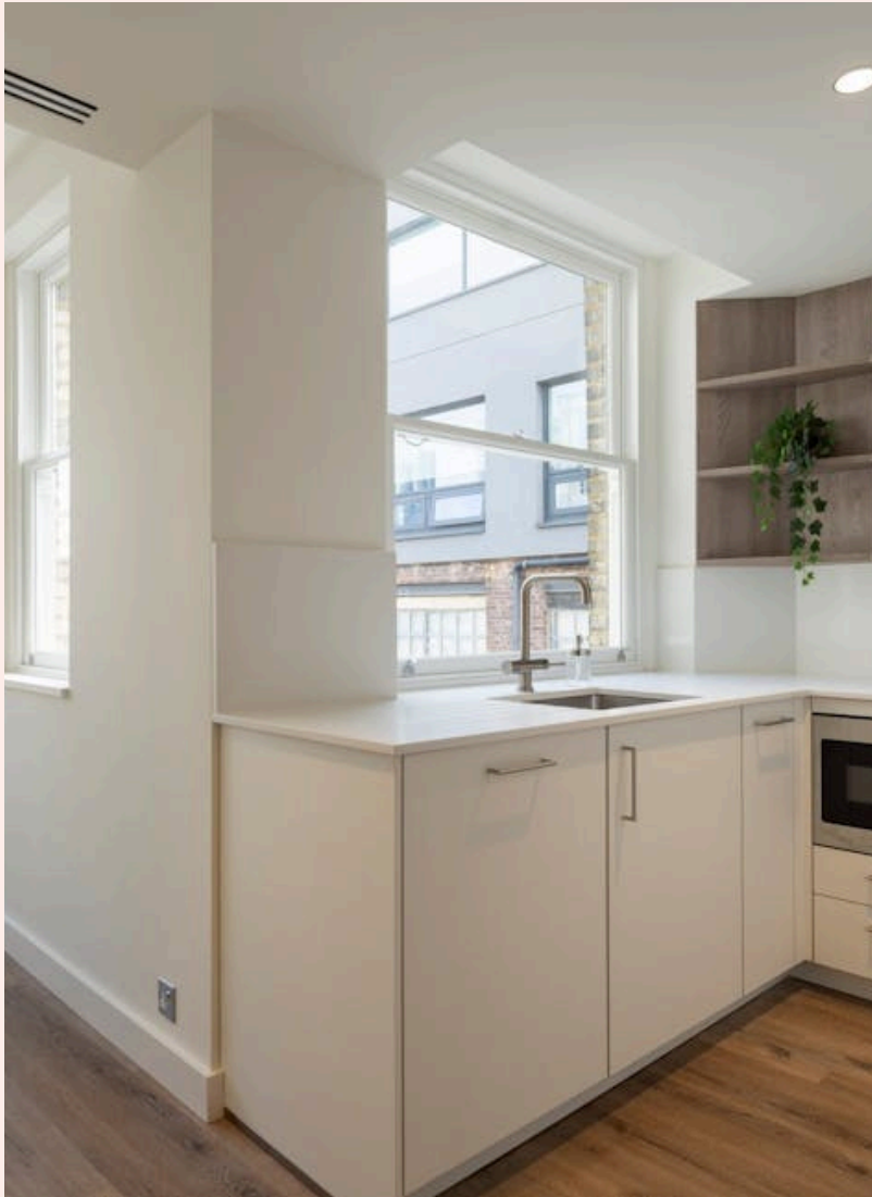
4th Floor Kitchen