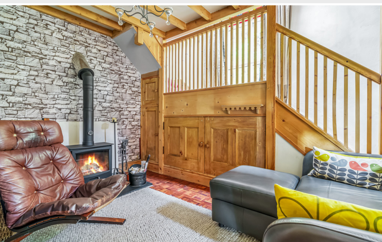
Open Plan Living Room