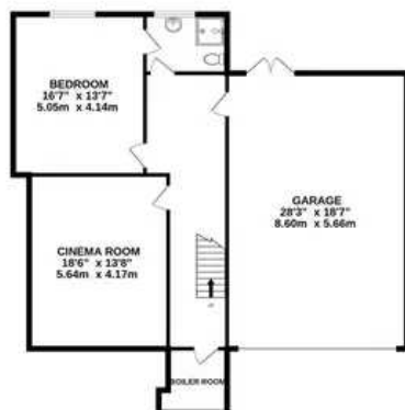
BASEMENT 1465 sq.ft. (136.1 sq.m.) approx.