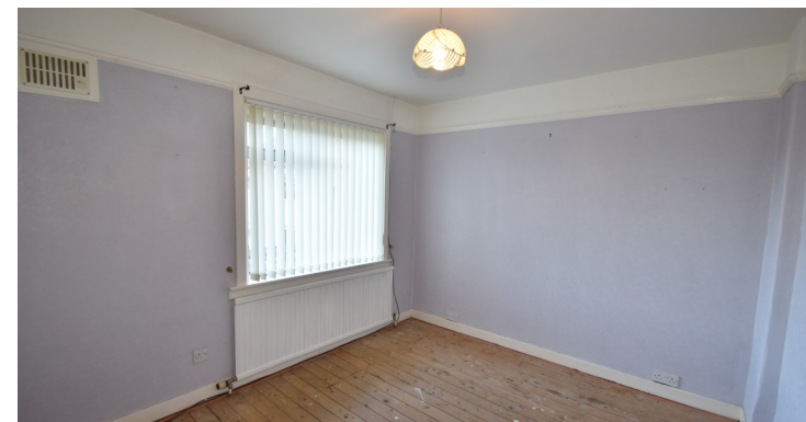
4 Oldwalls Place