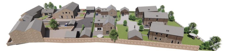
Old Hall Development