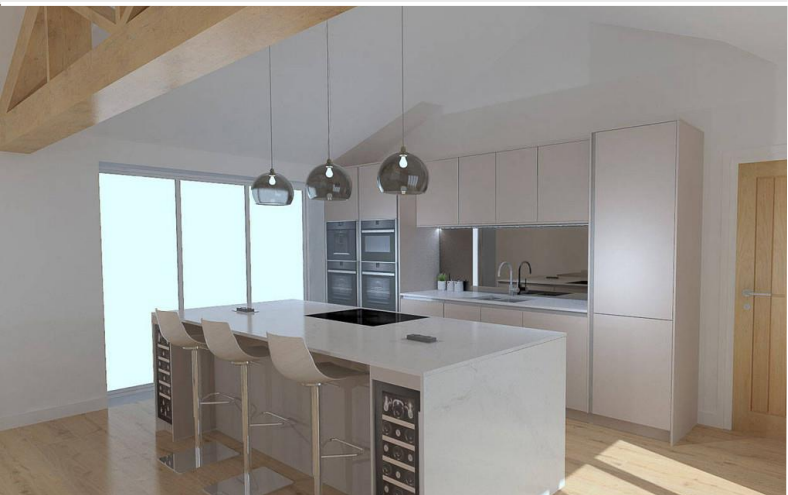
Illustration of kitchen

Location Welcome to Over Kellet, a charming village nestled in the Lancashire countryside. Here, you'll find a harmonious blend of natural beauty and a warm community atmosphere, creating the perfect setting for your new home. Close to the City of Lancaster which boasts both Boys' & Girls' Grammar Schools, two universities and a large hospital amongst an excellent selection of vibrant cultural and historic places of interest and a well-established high street shopping.