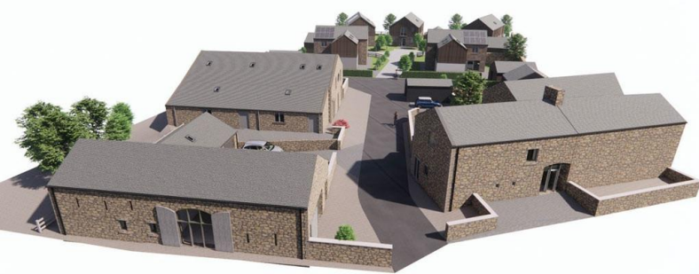
Old Hall Development