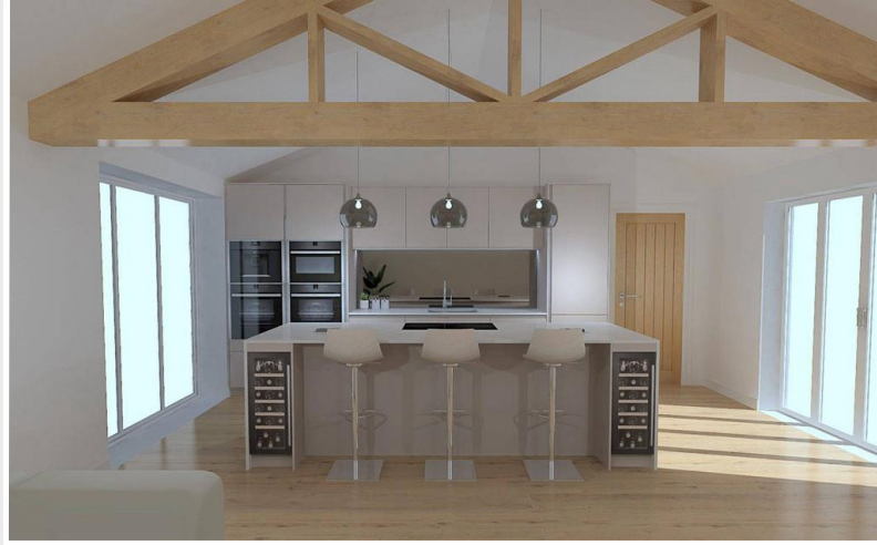
Illustration of kitchen

For more information and to schedule a viewing, contact our office on 01524 737727