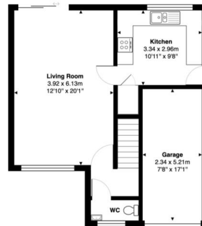
Ground Floor Area: 55.1 m 2 ... 593 ft 2