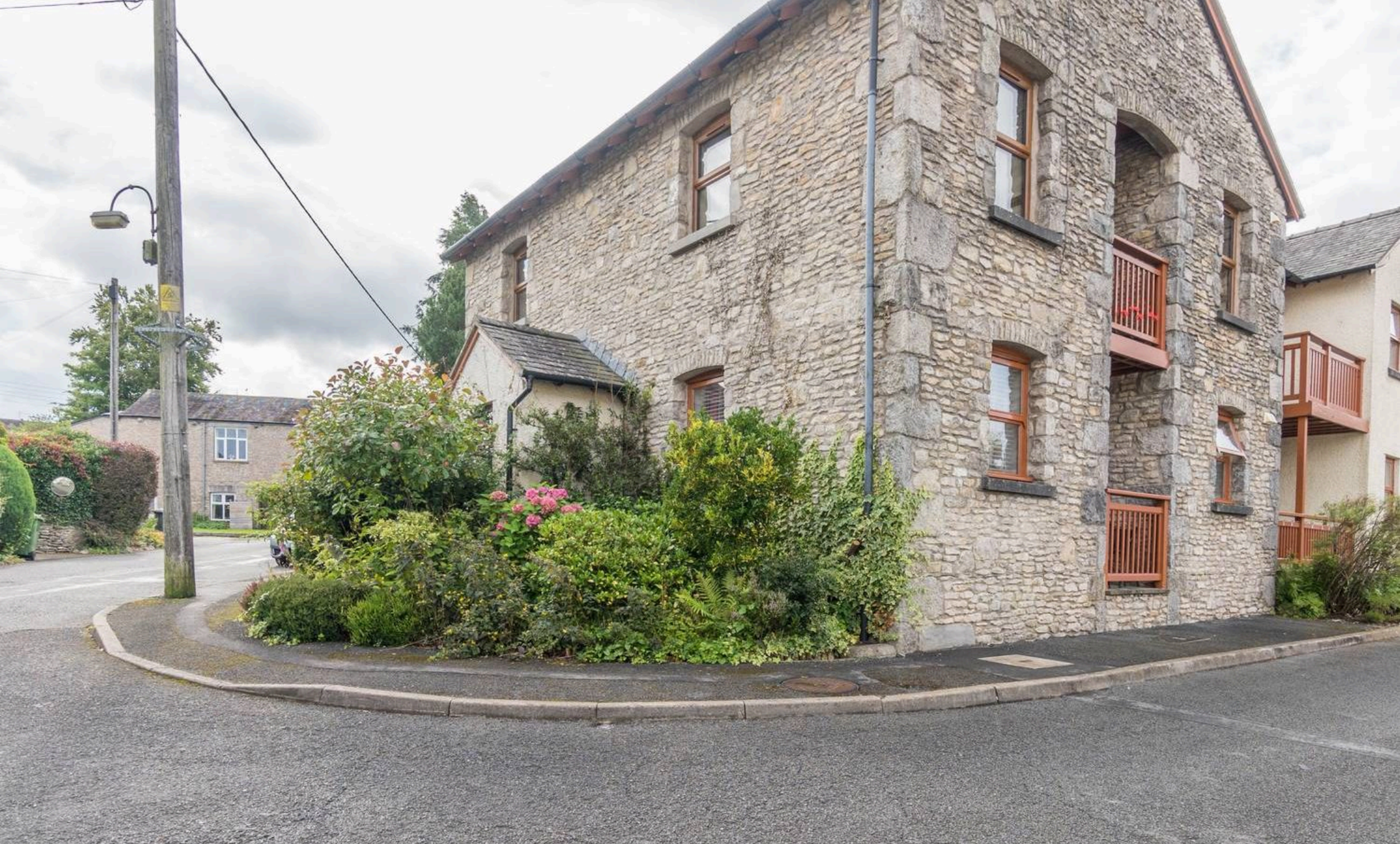
1 Beathwaite Gardens, Levens £235,000