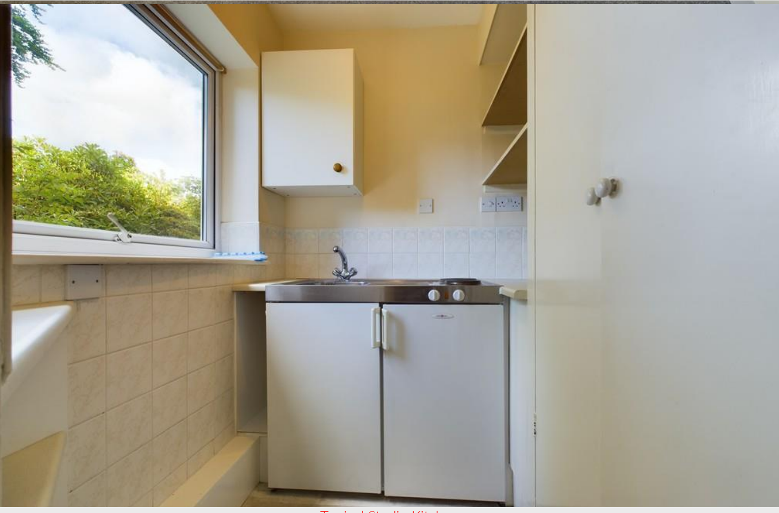
Typical Studio Kitchen