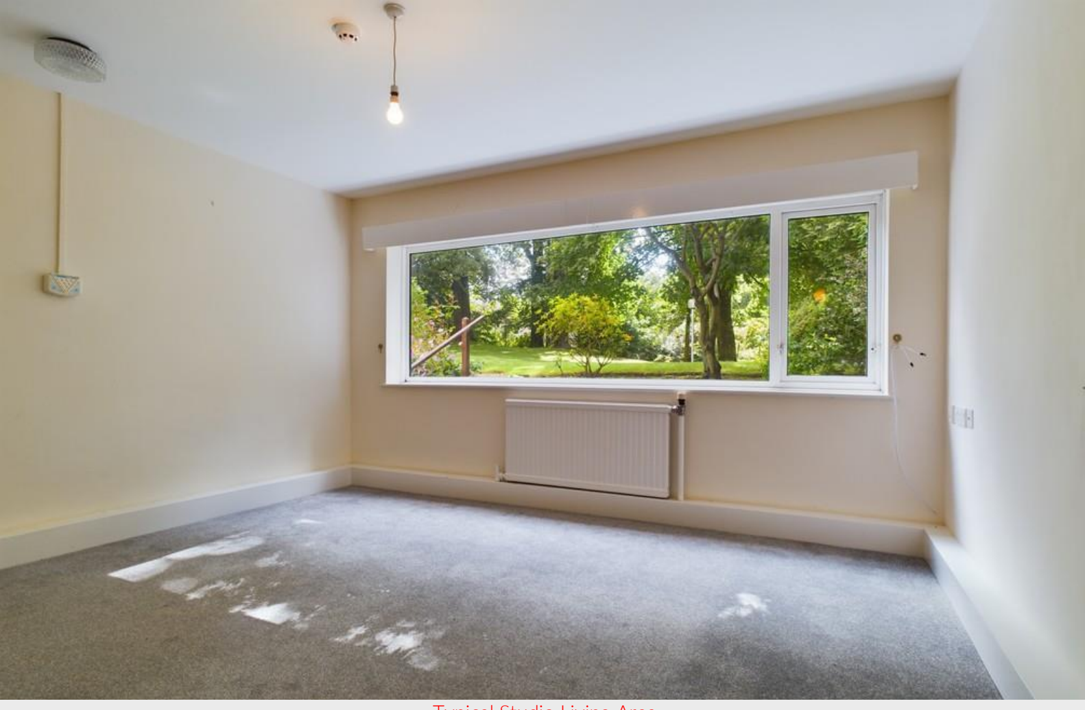
Typical Studio Living Area