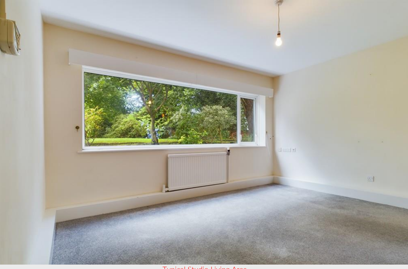
Typical Studio Living Area

Location: From Windermere follow the A5074 towards Ambleside Road. Turn left onto Ambleside Road and take the first left onto Phoenix Way. Nine Oaks can be found on the right-hand side.