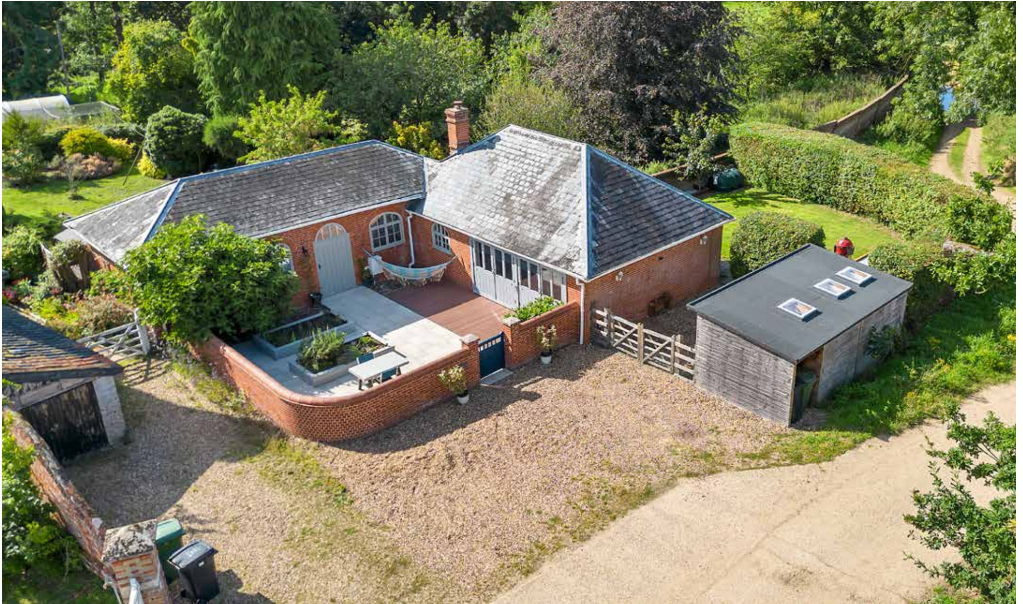
The Coach House Frenze | Scole | Norfolk | P21 4EZ