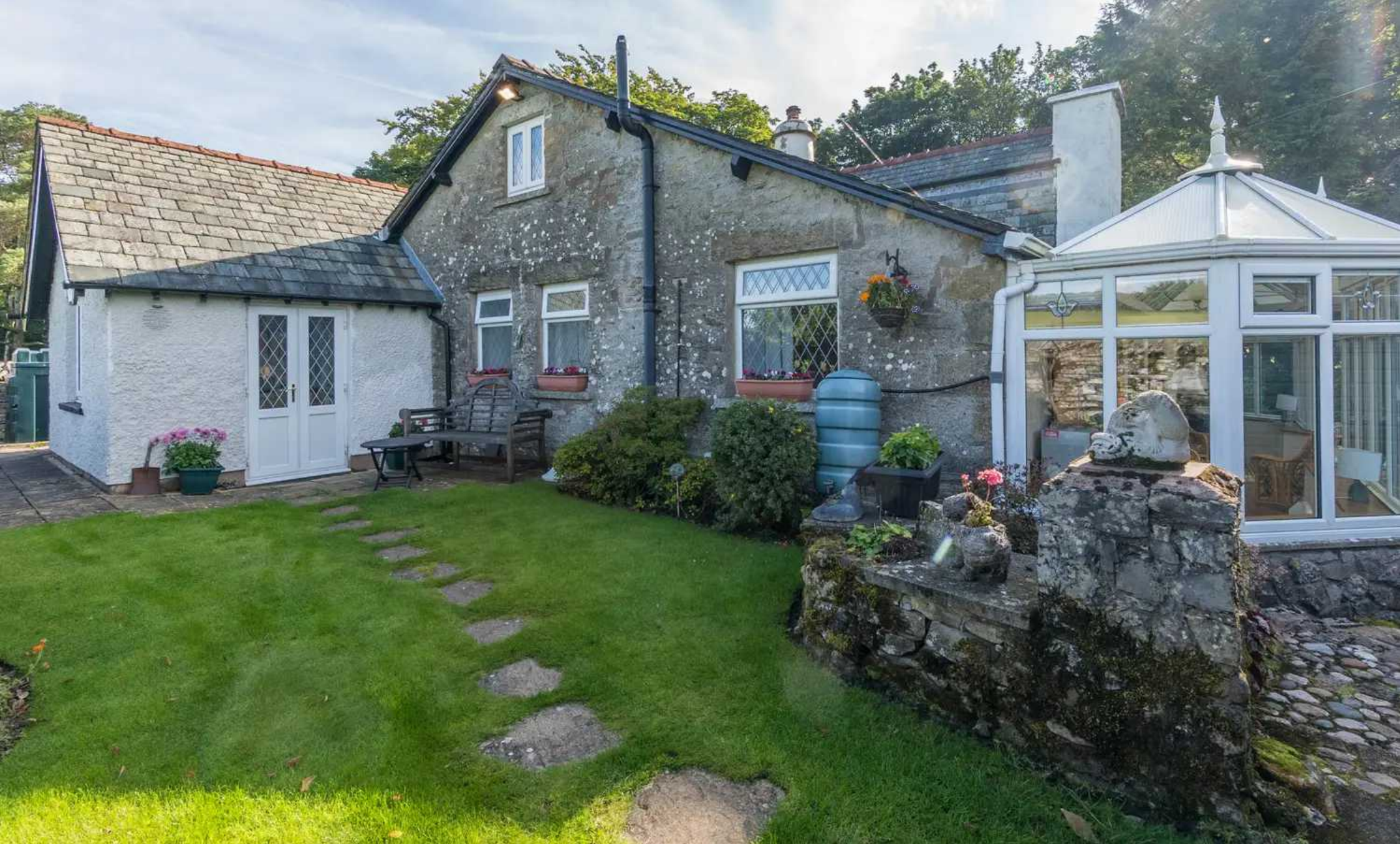
Howgill Lodge, Orton £420,000 Freehold