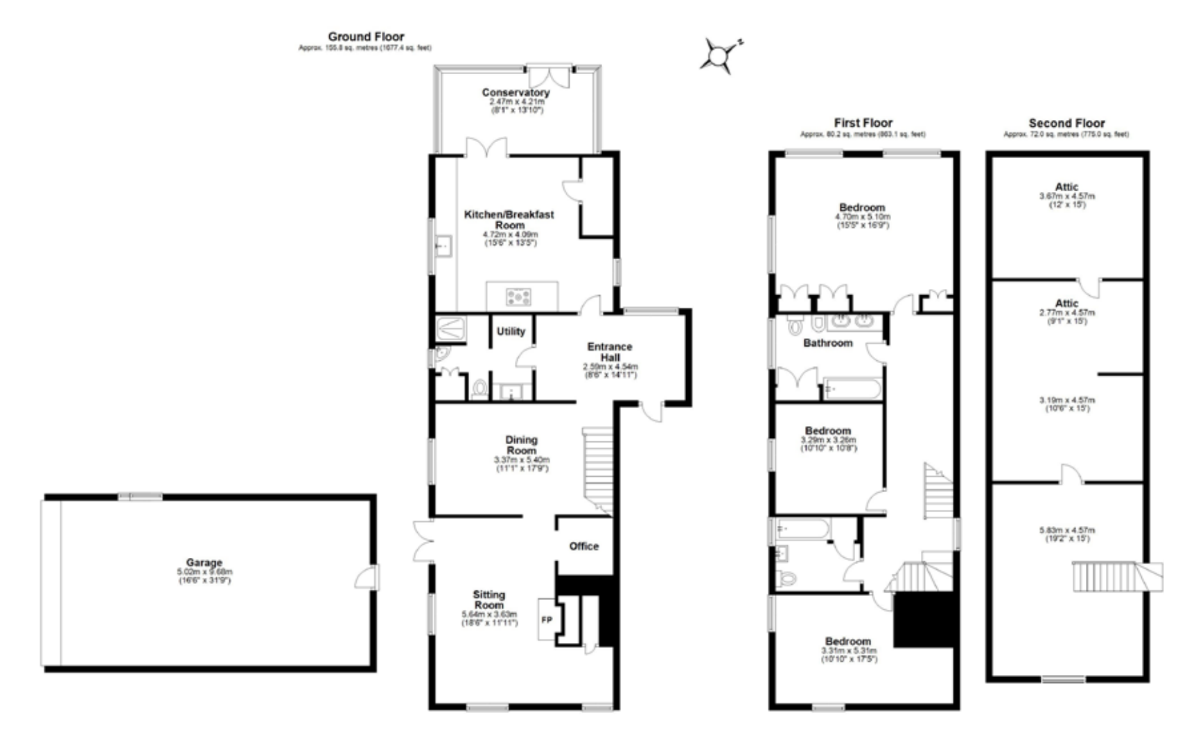
Total area: approx. 308.0 sq. metres (3315.5 sq. feet)

White every attempt has been made to ensure the accuracy of the floor pan contained here, measurements of doors windows ruoms and any other hams are approximate and no responsibility is belien for any errors, crisisson, or mis-attrement. This plan is for illustrative purposes only and should be used as such by any prospective purchases. The services, system and appliances shown here not been bested and no paramète as to their operating or efficiency can be given. Plan principled using Plants.