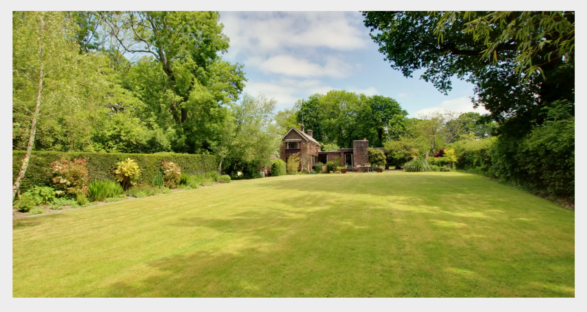
North End, Eastern Road, Wivelsfield Green, East Sussex RH17 7QH