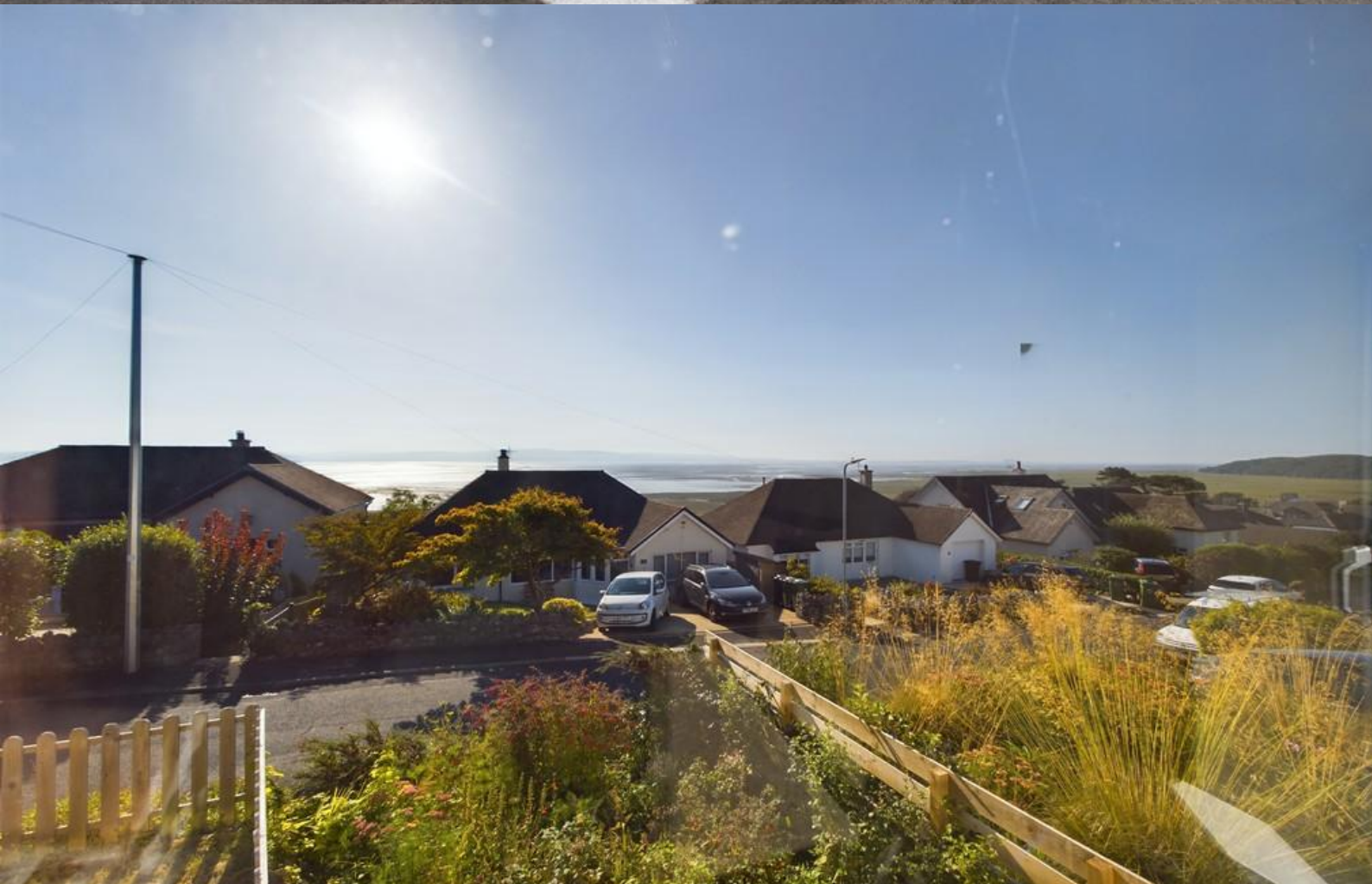
View Over The Estuary