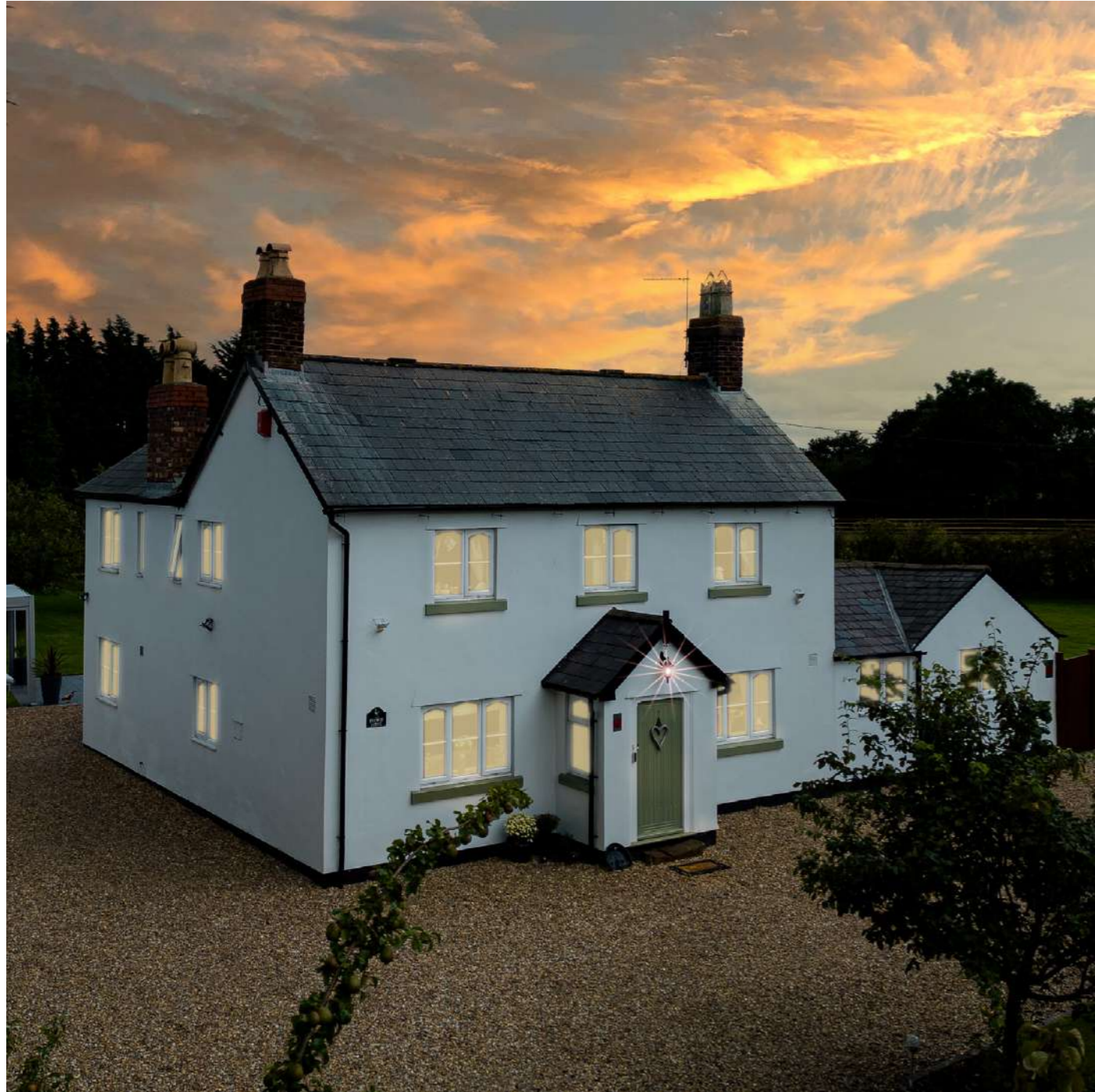
Peewit Lodge Farm