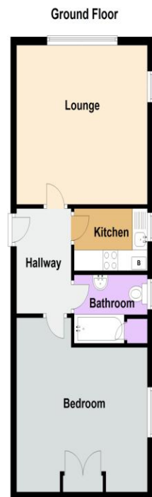
Total area: approx. 47.6 sq. metres (512.1 sq. feet)