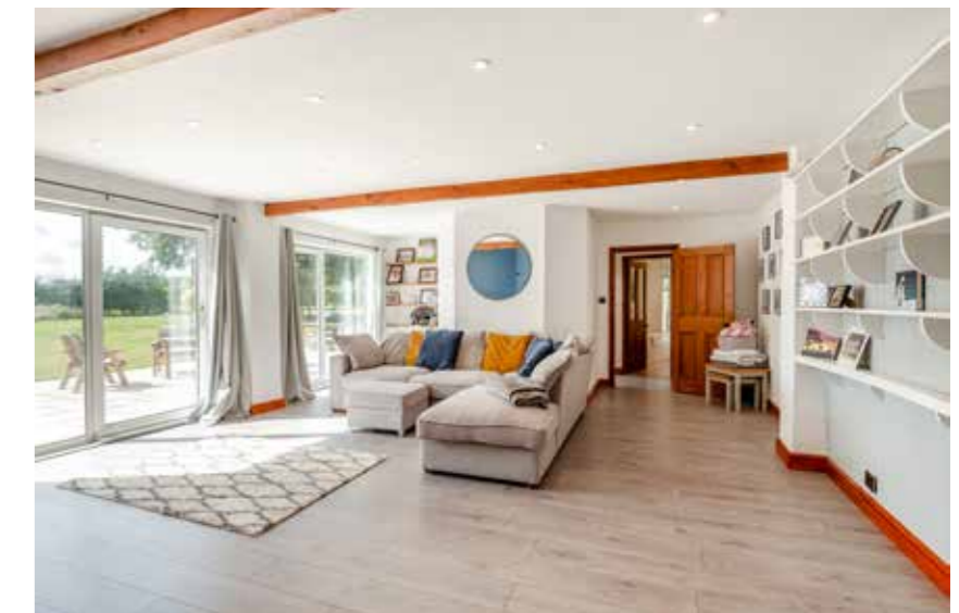
A Stunning Contemporary Space