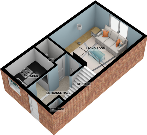
GROUND FLOOR 293 sq.ft. (27.2 sq.m.) approx.