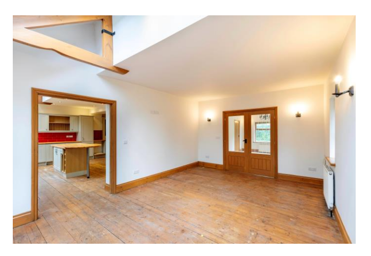
BREAKFAST KITCHEN 24'0" x 16'9" to 10'9" (7.32m x 5.11m to 3.29m) L-shaped, featuring pale green shaker style units, complementing dresser units, wood block work surfaces, complementing island, part vaulted ceiling, exposed beam accents, roof windows, exposed floorboarding, rear entrance door.

DINING ROOM 18'5" x 11'10" (5.62m x 3.60m) dual aspect with part vaulted ceiling, exposed beams and roof windows, exposed floorboarding, double doors to Sitting Room