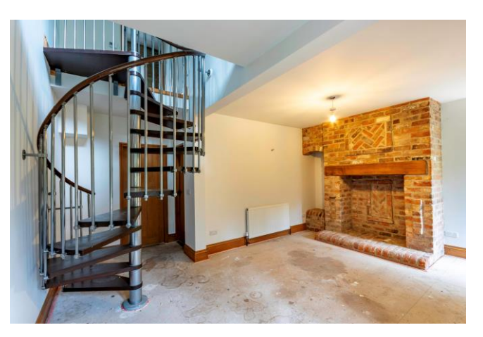
SITTING ROOM 16'9" x 11'10" (5.62m x 3.60m) fireplace with log burner, double doors to

substantial rustic brick fireplace, feature corner bay window, front entrance door, spiral staircase.