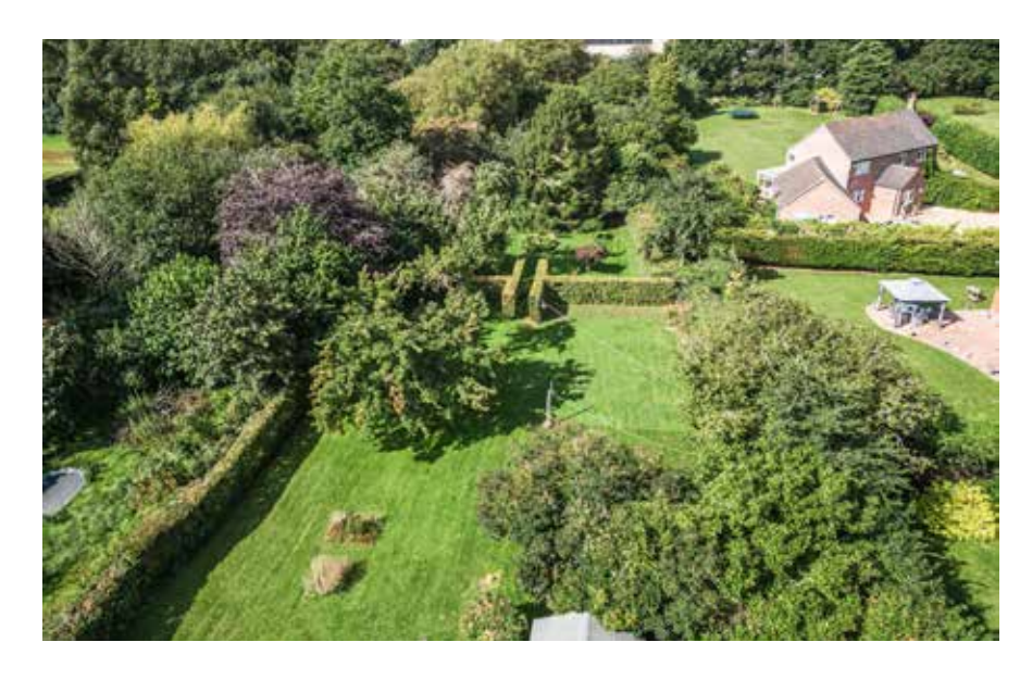
"Having such a large garden makes it a pleasure when friends and family come to stay or visit."