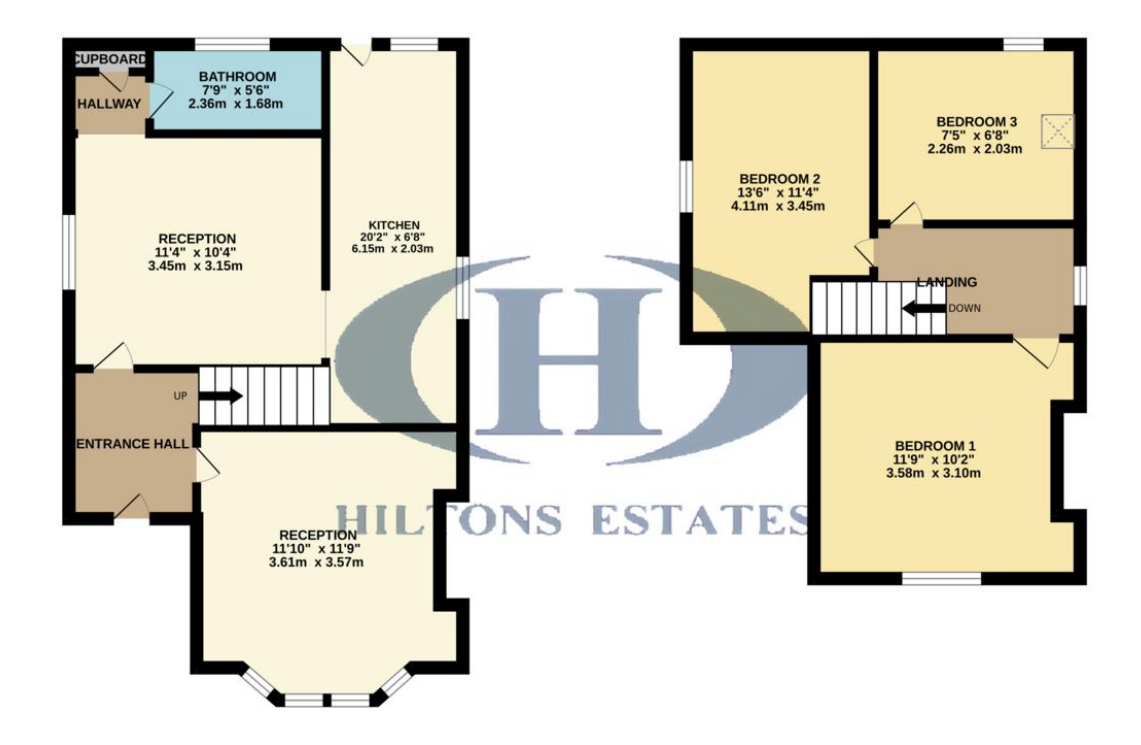
1ST FLOOR 343 sq.ft. (31.9 sq.m.) approx.

GROUND FLOOR 442 sq.ft. (41.1 sq.m.) approx.