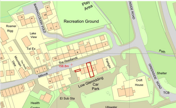
Ordnance Map Ref 01141920