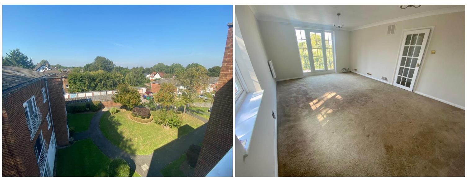
53 Freshwood Way, South Wallington, Surrey, SM6 0RL | £295,000 Share of Freehold

Paul Graham are pleased to offer this 2 double bedroom 3rd floor flat with share of freehold and garage en-bloc. The property boasts a spacious lounge/diner with Juliet balcony, a fitted kitchen, two double bedrooms (both with fitted wardrobes) and modern bathroom. The property is offered for sale with no chain.