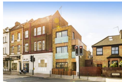
Harrow Road, Kensal Green NW10 £2,100 pcm

Mile are pleased to bring to market this great two bedroom split level apartment