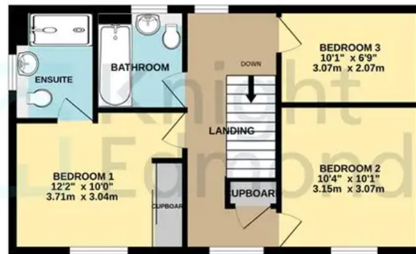
1ST FLOOR 491 sq.ft. (45.7 sq.m.) approx.