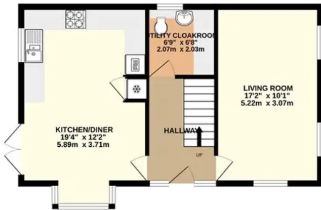
GROUND FLOOR 507 sq.ft. (47.1 sq.m.) approx.