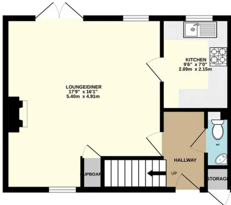
GROUND FLOOR 403 sq.ft. (37.4 sq.m.) approx.