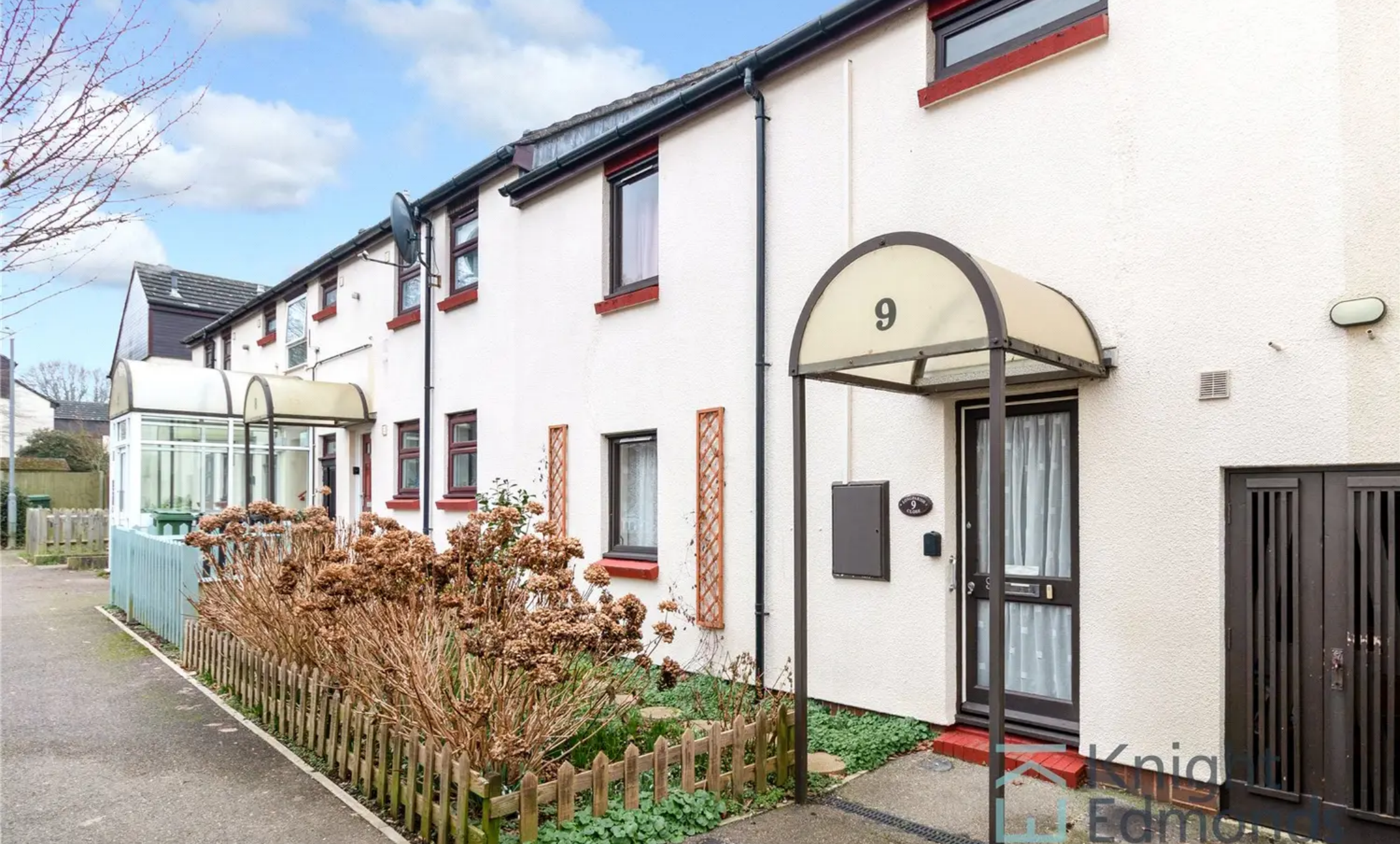
9 Longparish Close, Maidstone £250,000