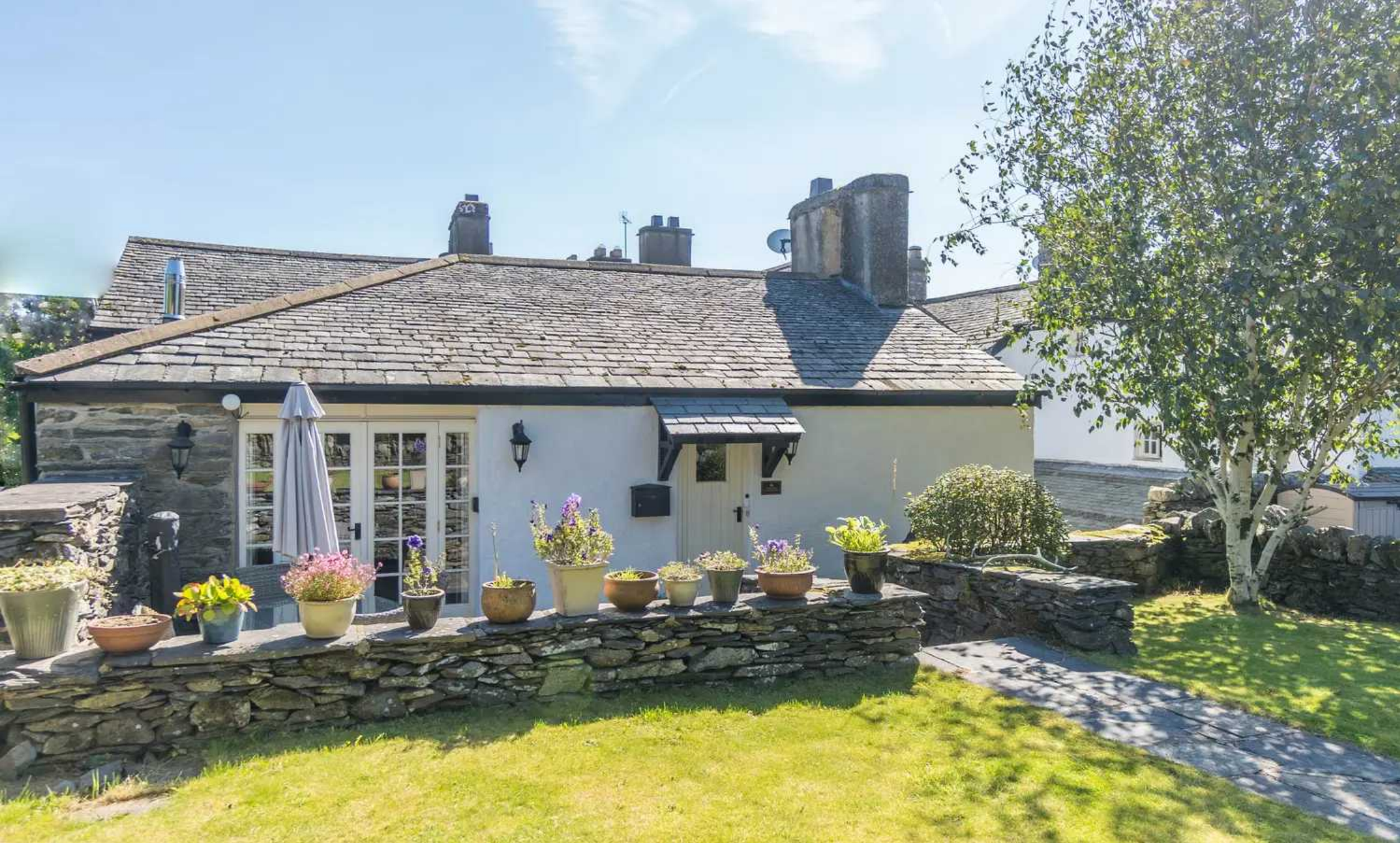
The Old Courthouse, Backbarrow £465,000