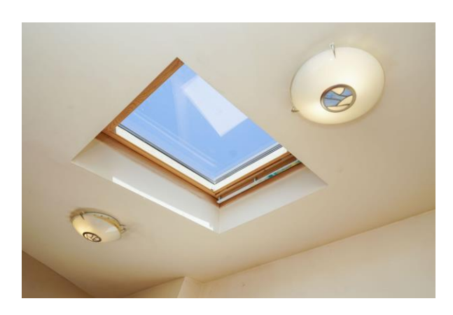
Downstairs Wc/Utility Room