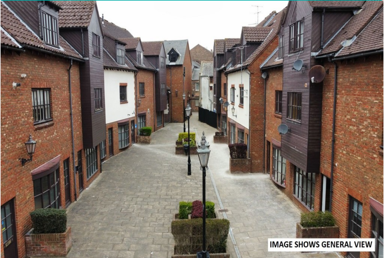
IMAGE SHOWS GENERAL VIEW