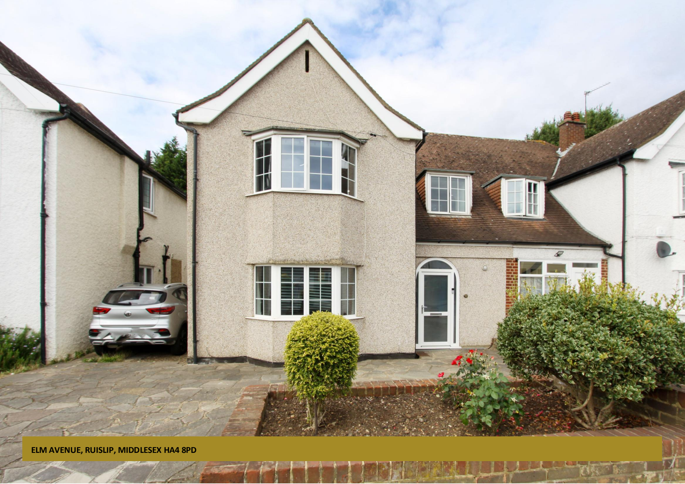
ELM AVENUE, RUISLIP, MIDDLESEX HA4 8PD