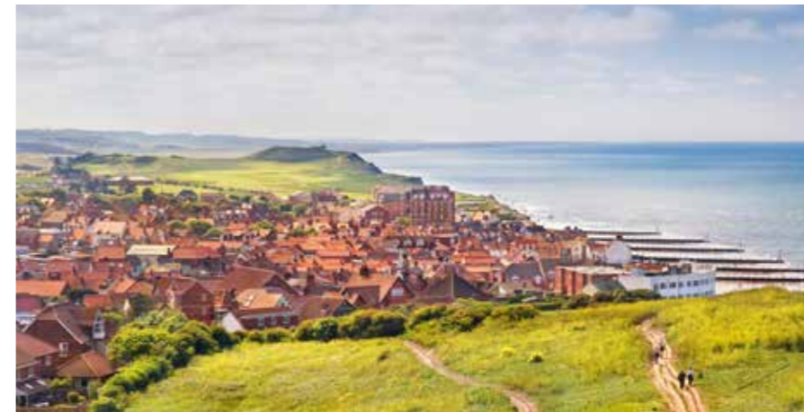
For a sense of the seaside, Sheringham is a lovely place to explore.

“With so many beaches, so much countryside and the surrounding villages, it's impossible to pick just one favourite spot locally.”