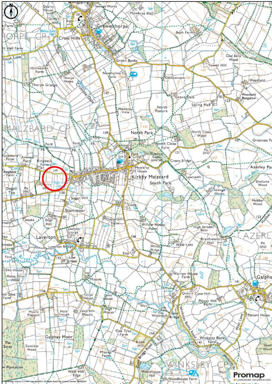
Location Plan – Not To Scale For Identification Purposes Only