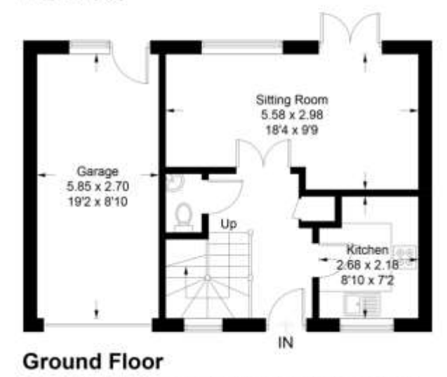
Illustration for identification purposes only, measurements are approximate, not to scale. Imageplansurveys @ 2023