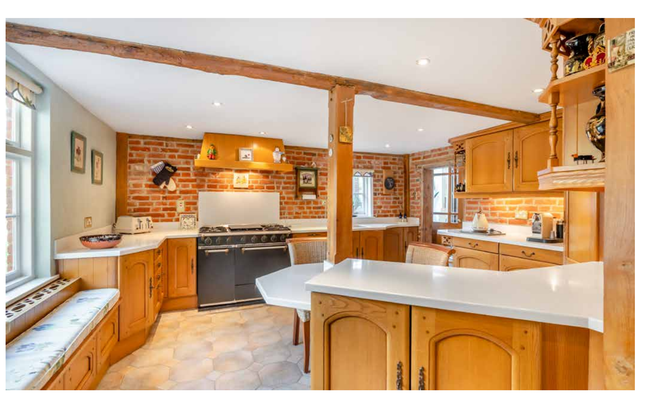
"The kitchen is a warm, welcoming and delightful space..."