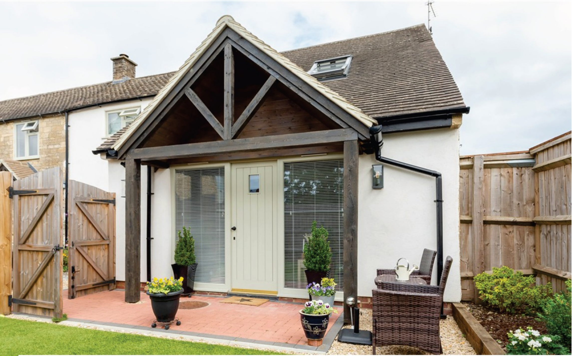
Acre Mews, Long Hanborough