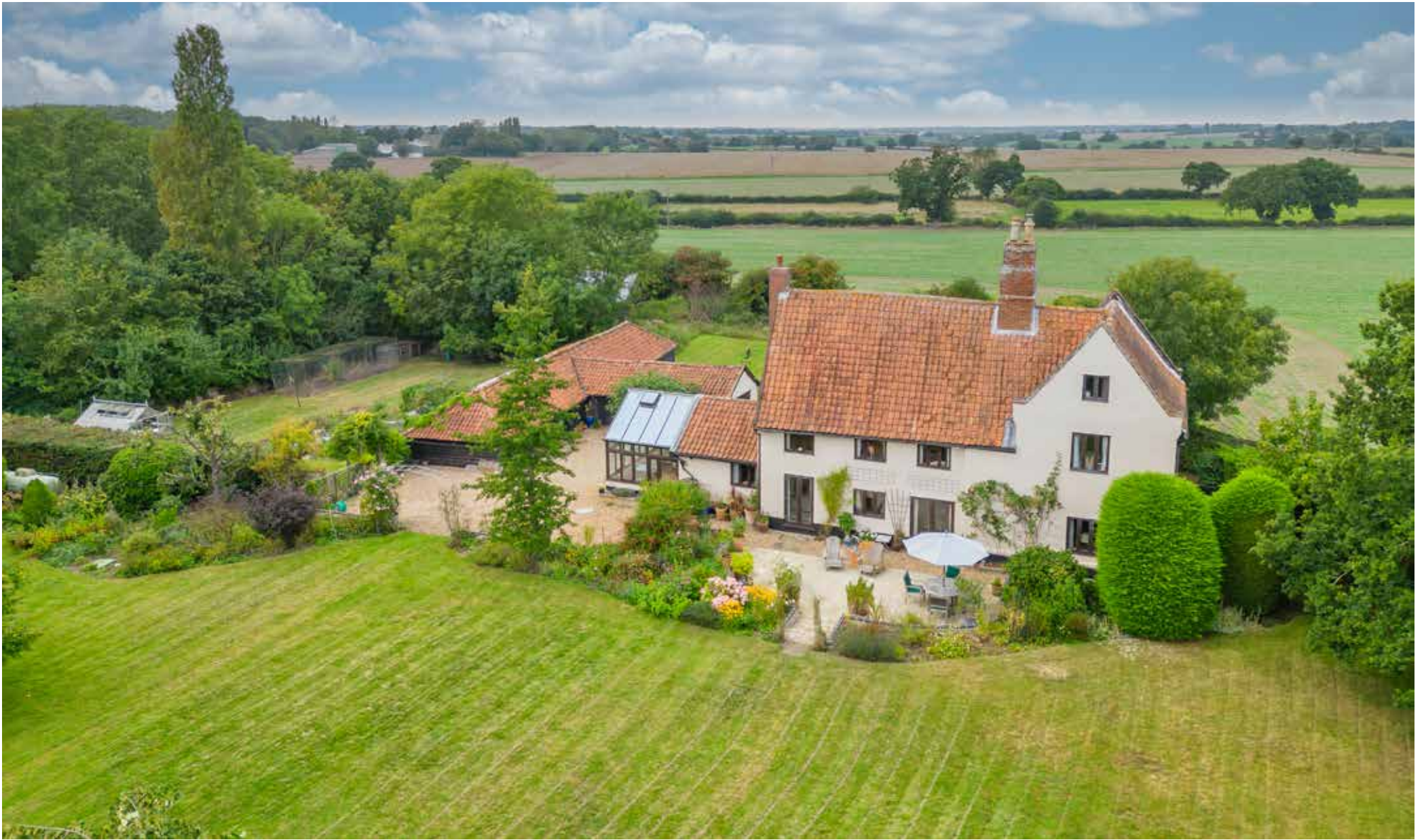
Yeomans Farmhouse Halesworth Road | Ilketshall St. Lawrence | Suffolk | NR34 8NJ