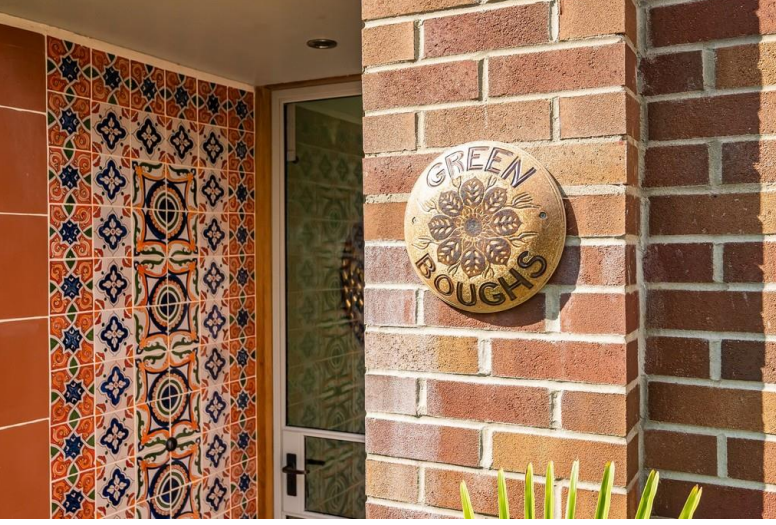
Mill Road, Hempnall, Norwich Guide Price £895,000 Freehold Energy Efficiency Rating: C