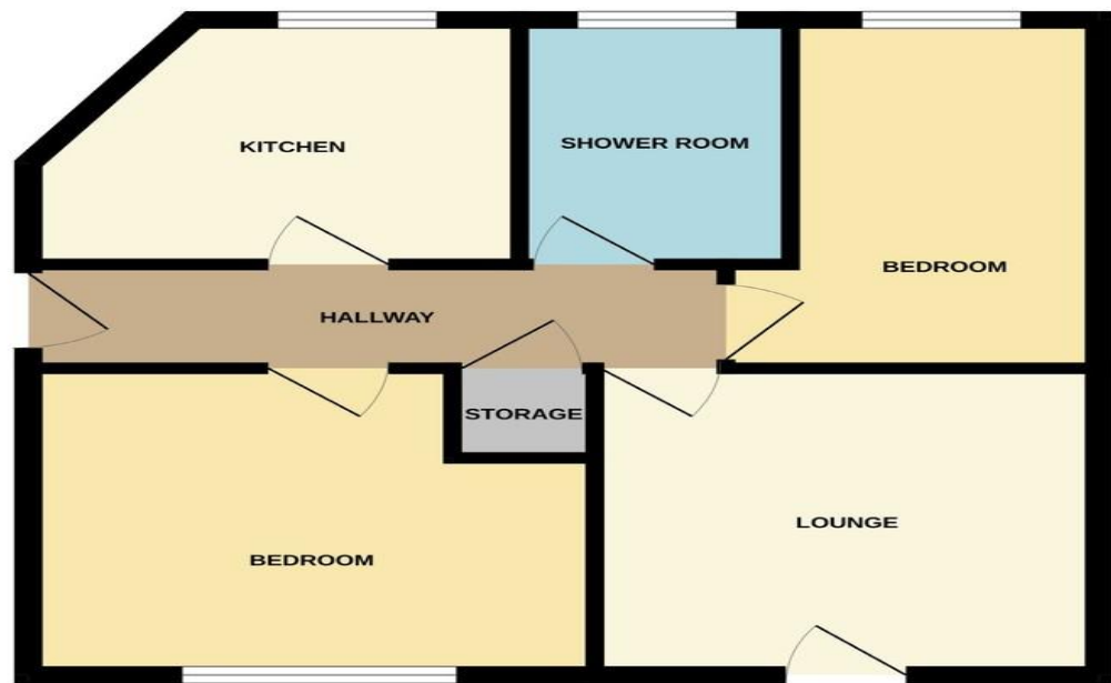
GROUND FLOOR 478 sq.ft. (44.4 sq.m.) approx.

TOTAL FLOOR AREA: 478 sq.ft. (44.4 sq.m.) approx. Whilst every attempt has been made to ensure the accuracy of the description contained here, measurements of doors, windows, rooms and any other items are approximate and no responsibility is taken for any error, omission or mis-statement. This plan is for illustrative purposes only and should be used as such by any prospective purchaser. The services, systems and appliances shown have not been tested and no guarantee as to their operability or efficiency can be given. Made with Metropix ©2023