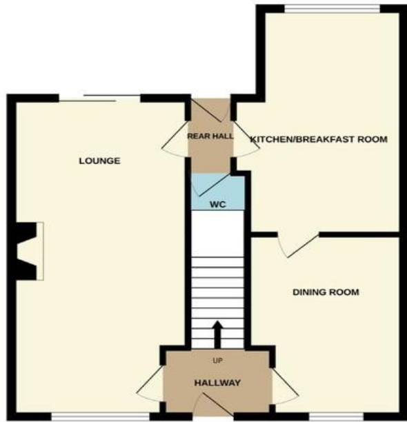
GROUND FLOOR 567 sq.ft. (52.7 sq.m.) approx.