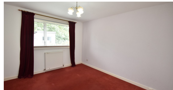
35 Sunnyside Court