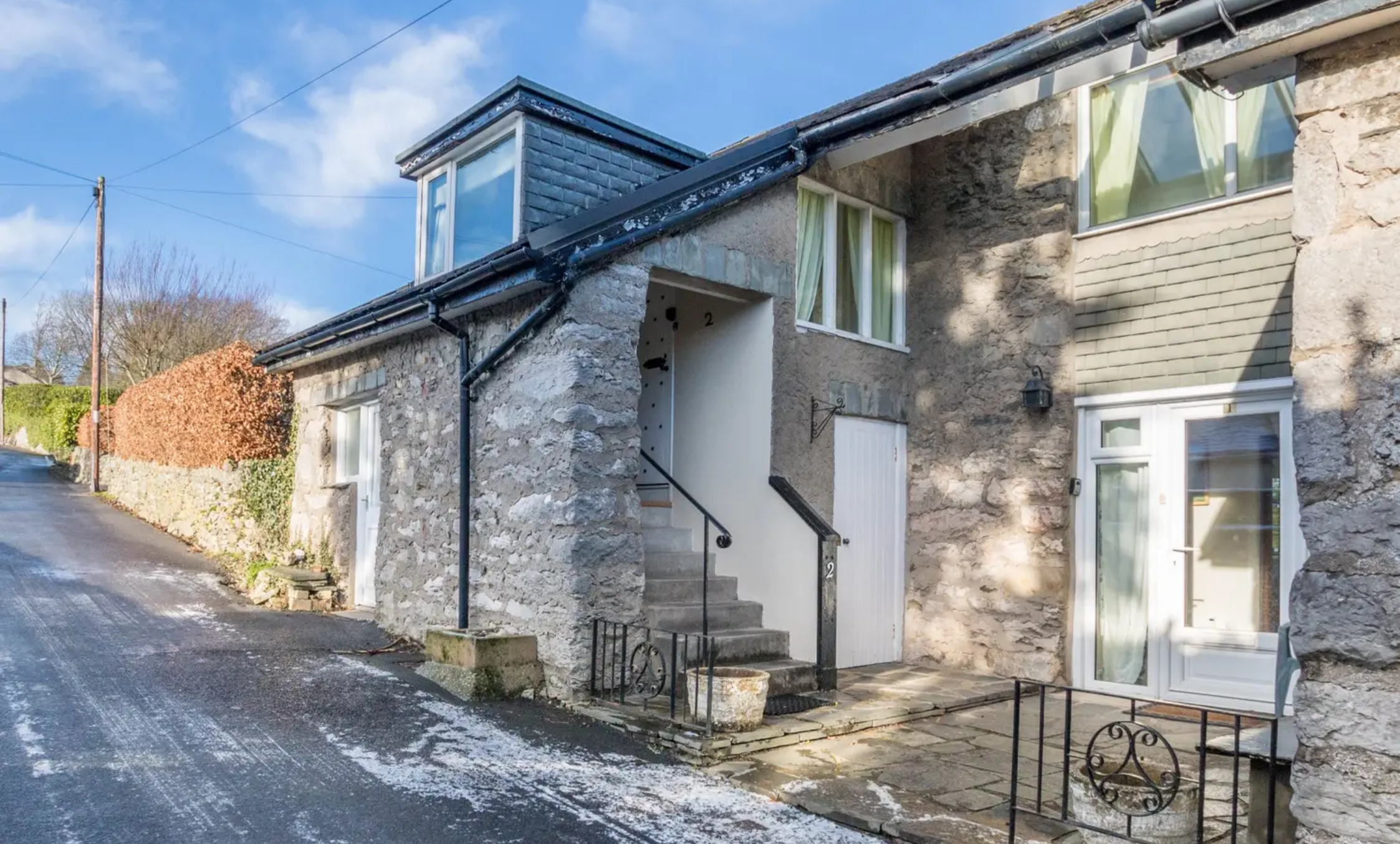
2 Yew Tree Court Cart Lane, Grange-Over-Sands £230,000