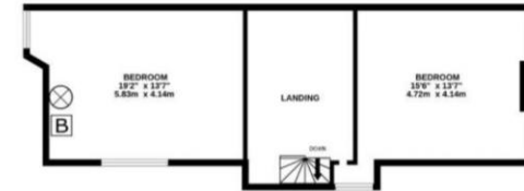
TOTAL FLOOR AREA : 4045 sq.ft. (375.8 sq.m.) approx.

Whilst every attempt has been made to ensure the accuracy of the floorplan contained here, measurements of doors, windows, rooms and any other items are approximate and no responsibility is taken for any error, omission or mis-statement. This plan is for illustrative purposes only and should be used as such by any prospective purchaser. The services, systems and appliances shown have not been tested and no guarantee as to their operability or efficiency can be given. Made with Metropix ©2023