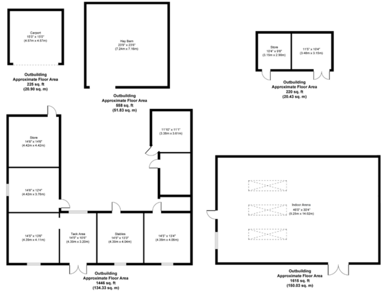
(Outbuildings are not shown in their actual location)