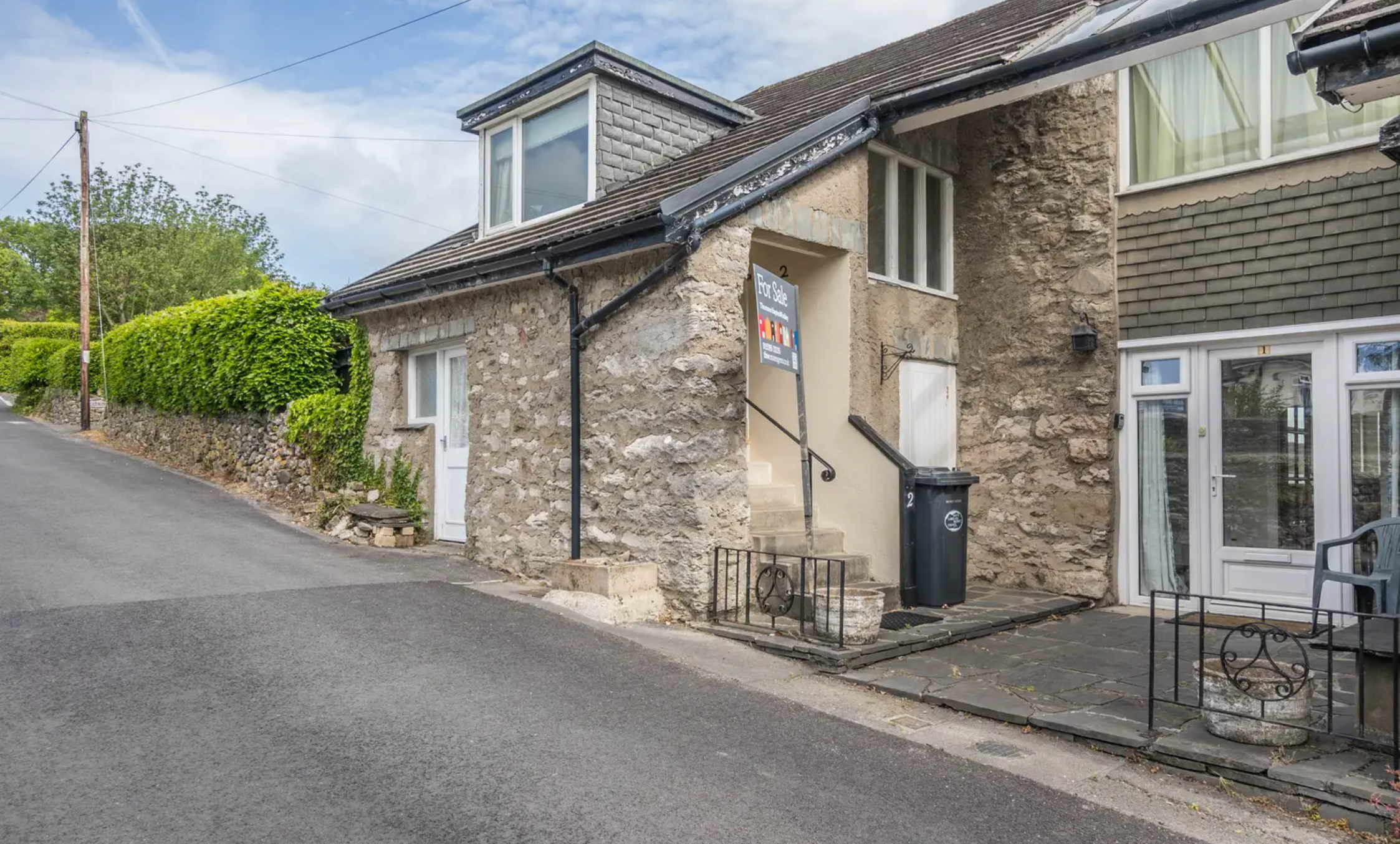
2 Yew Tree Court Cart Lane, Grange-Over-Sands £200,000