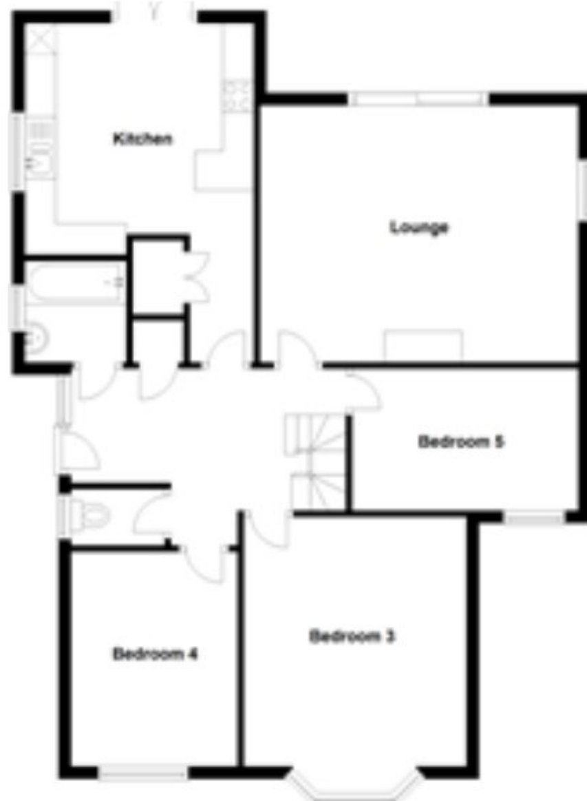
First Floor Approx. 48.6 sq. metres (523.4 sq. feet)