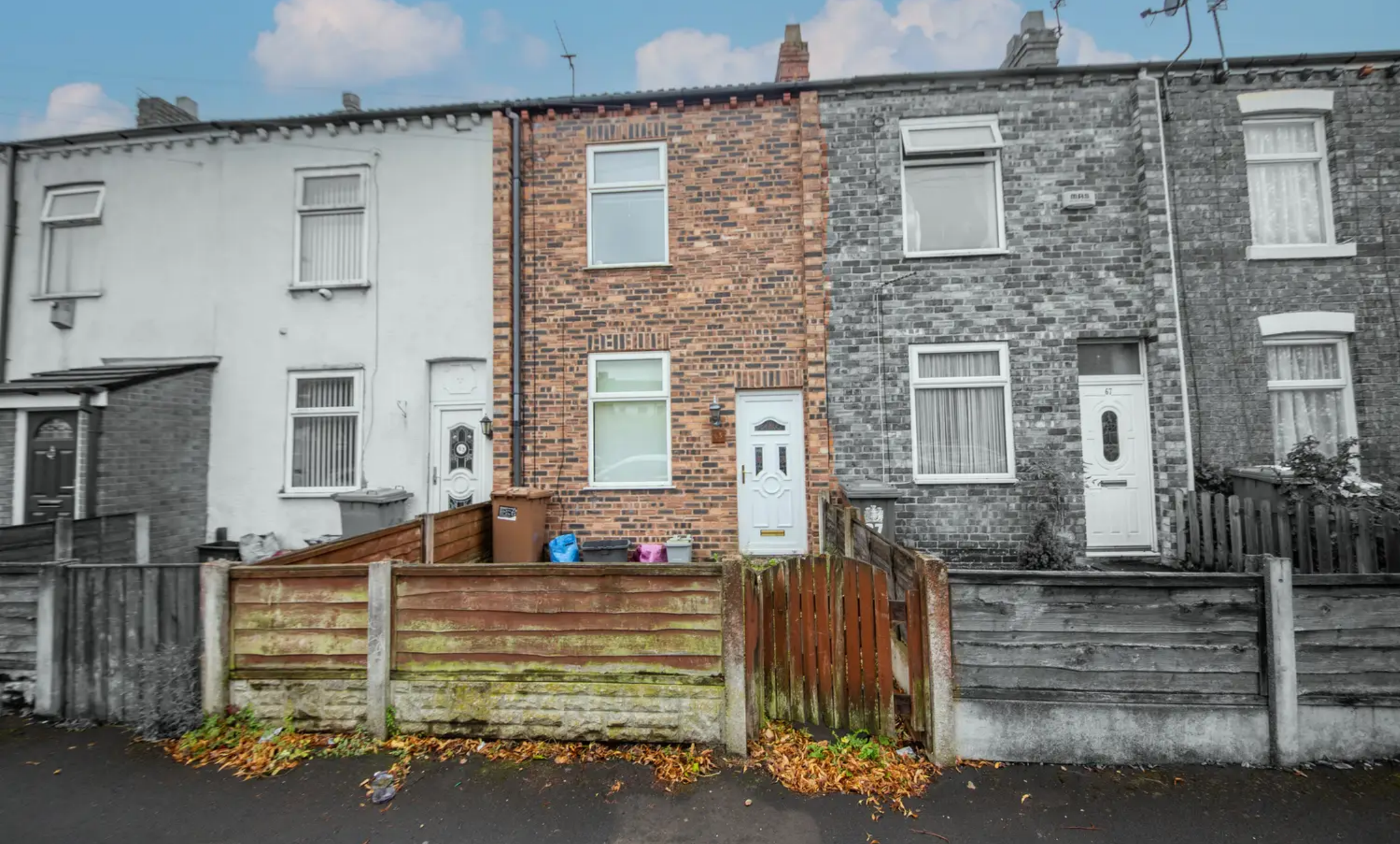
65 Mercer Street, Newton-Le-Willows £700 pcm