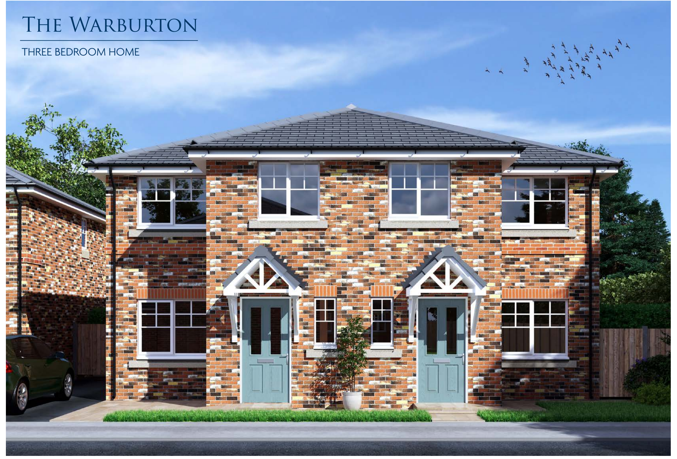
Images, photographs and CGI's are representative only and are not plot specific. External finishes, landscaping and configuration may vary from plot to plot, Wiggett Homes reserves the right to amend and update the specification. Please refer to your Sales Consultant for plot specific details.